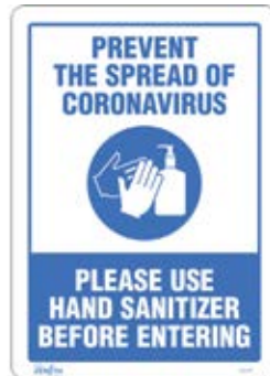
SGU357 14 X 10" $14.25 each