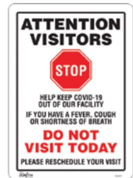
SGU351 10 X 14" $14.25 each