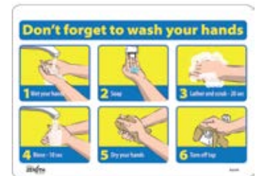
SGU296 10 X 14" $14.25 each