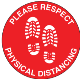
PICOVID11E 18" $11.95 each