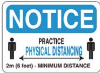
PICOVID2E3VY 10 X 14" $9.95 each